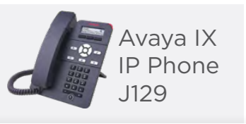
Avaya IX IP Phone J129