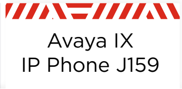
Avaya IX IP Phone J159