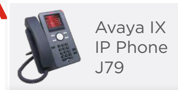
Avaya IX IP Phone J79