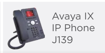
Avaya IX IP Phone J139