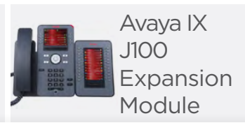
Avaya IX J100 Expansion Module