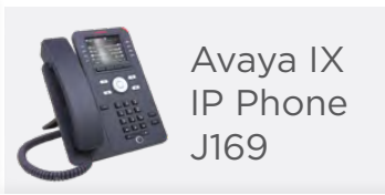
Avaya IX IP Phone J169