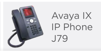
Avaya IX IP Phone J79