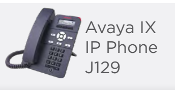
Avaya IX IP Phone J129