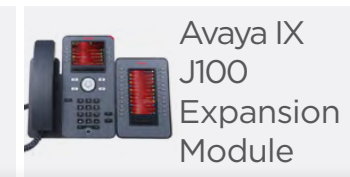
Avaya IX J100 Expansion Module