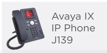
Avaya IX IP Phone J139