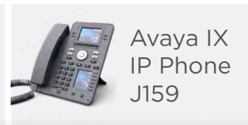
Avaya IX IP Phone J159